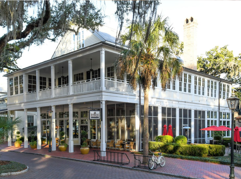
↑ Home to popular spots like Buffalo's, FLOW Gallery, and the Village Green, Wilson Village is a hub of activity among both residents and visitors.