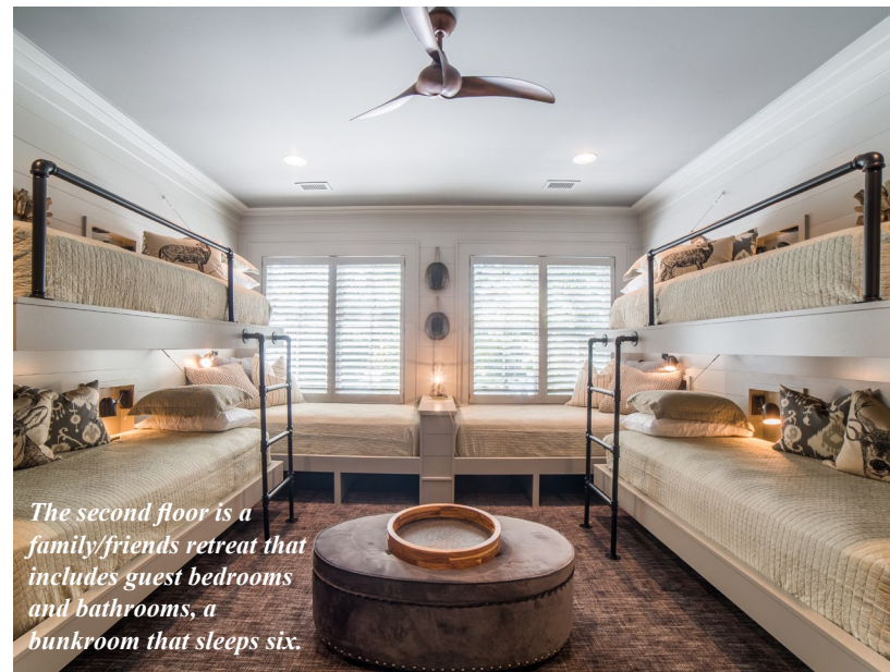
The second floor is a family/friends retreat that includes guest bedrooms and bathrooms, a bunkroom that sleeps six.

CARPET • HARDWOOD • LAMINATE TILE & STONE • VINYL • AREA RUGS GRANITE & QUARTZ